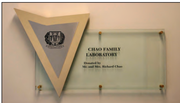
A gift from the Chao Family help fund a School of Pharmacy research laboratory located in the Chan Shun Pavilion.